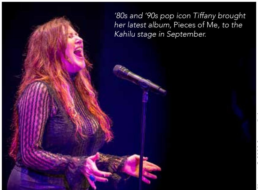
'80s and '90s pop icon Tiffany brought her latest album, Pieces of Me, to the Kahilu stage in September.

The season was suddenly cut short in March by the pandemic, preempting such popular artists as Joan Osborne, Buffy St. Marie, and Robert Cazimero. But even though abbreviated, the 39 th season nonetheless delivered both a full measure of artistic excellence and a joyous celebration of the arts.