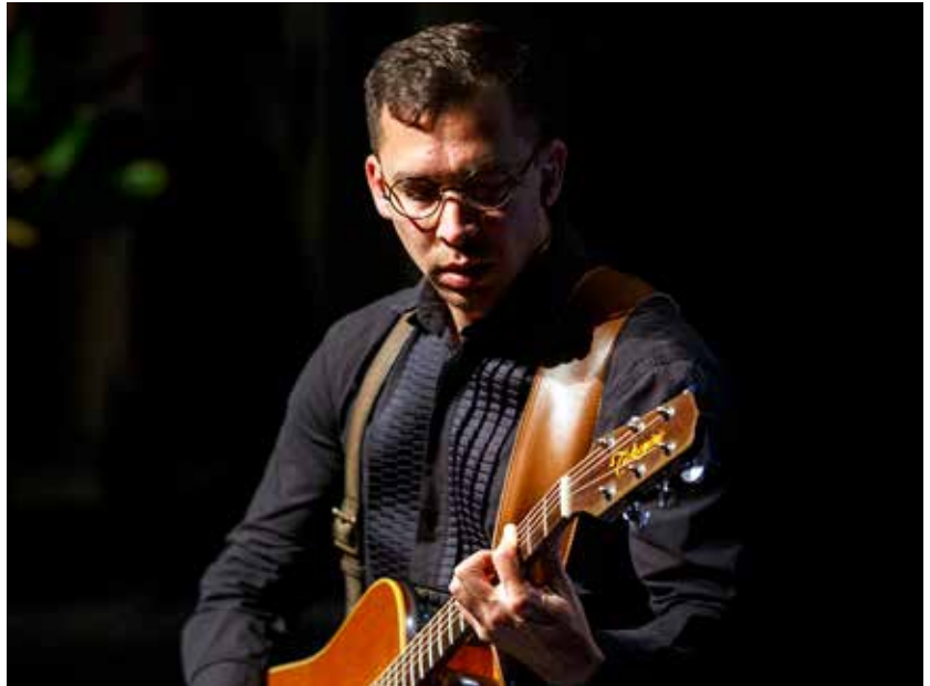
Kahilu Theatre's final pre-pandemic performance featured renowned slack-key singer/guitarist Makana in concert.